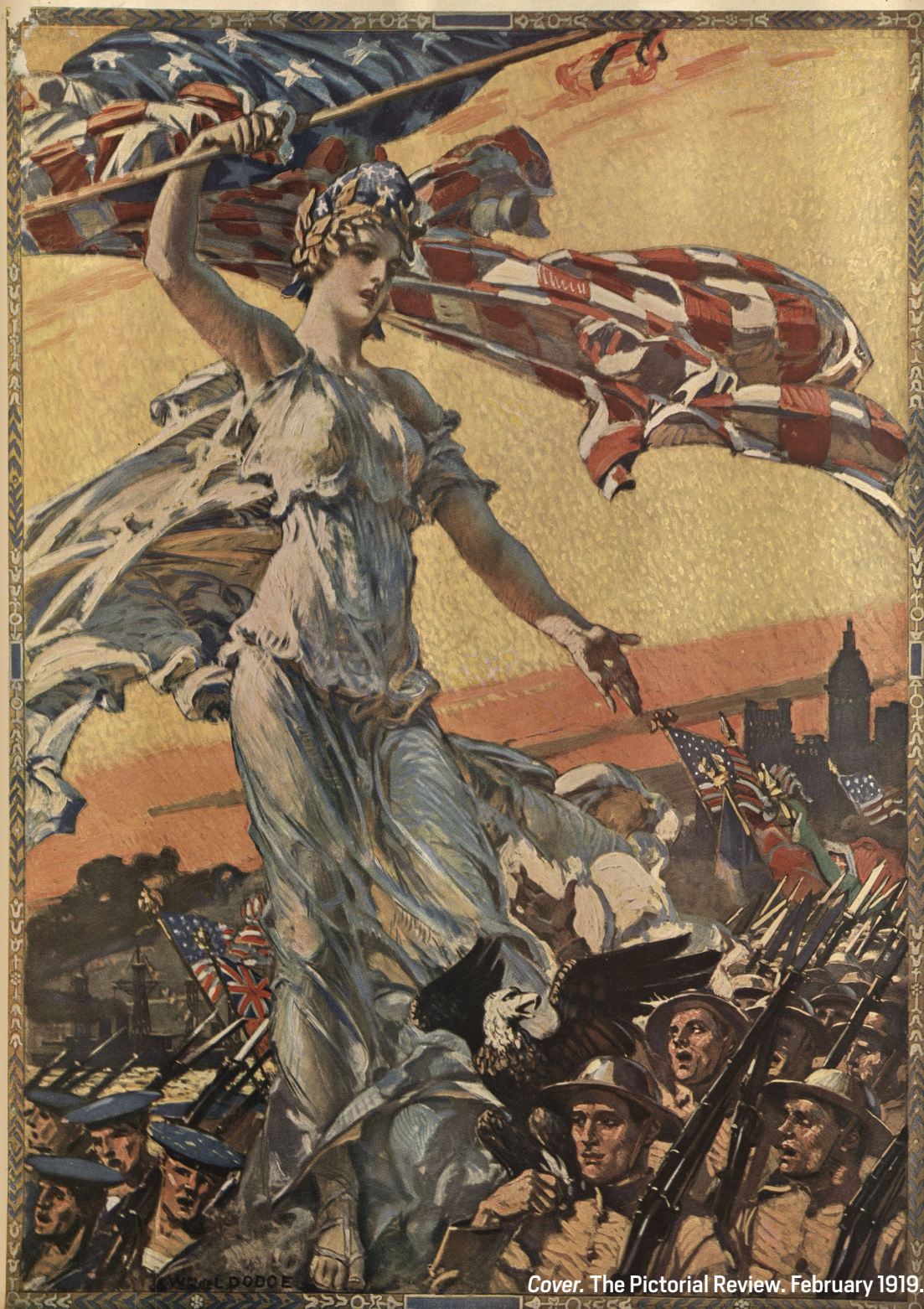
Cover. The Pictorial Review. February 1919.